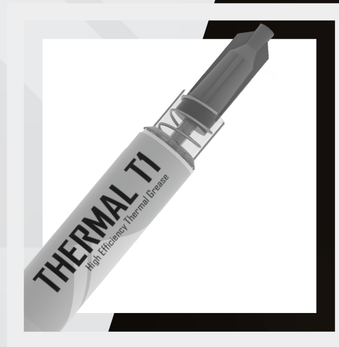
PRECISION APPLICATOR APPLY WITHOUT SPILLING GREASE PRECISELY