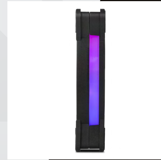
RUBBER STABILIZERS ABSORB THE VIBRATIONS, MAX PERFORMANCE & LOW NOISE